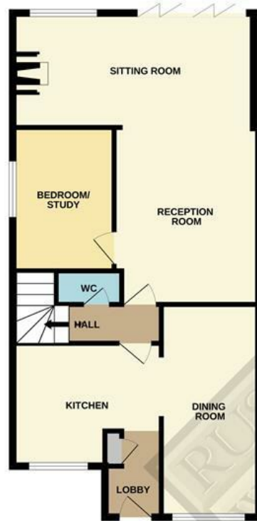
1ST FLOOR 512 sq.ft. (47.6 sq.m.) approx.